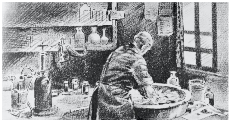
An illustration of Ignaz Semmelweis washing his hands in chlorinated lime water before operating on a patient.

patients. Ignaz Semmelweis and Oliver Wendall Holmes drew conclusions from their respective hospitals in Austria and Boston. In 1847, Semmelweis noticed that the maternal mortality rates were much higher at a hospital where surgeons and students did not wash their hands between performing autopsies and delivering babies. Semmelweis attributed this to “cadaverous particles” and a bad smell, and subsequently recommended that surgeons wash their hands with a chlorinated lime solution. The mortality rates dropped. 5 In 1843, Holmes drew a similar conclusion, saying that doctors were “angels of death” if they did not wash their hands. 6 Despite the evidence, Semmelweis and Holmes faced backlash and mocking for their beliefs. The doctors at Semmelweis’s hospital pushed back and eventually stopped their handwashing and Semmelweis himself was fired. 7 Neither Semmelweis’s nor Holmes’s work would gain traction until Louis Pasteur and Robert Koch made their contributions to the acceptance of germ theory in the late nineteenth century. 8 Nonetheless, these early medical studies provided a basis for germ theory and understanding the importance of handwashing.