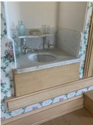
A sink in a bedroom located in the servant’s quarters ( left ) and a sink in the master bath ( right ). The David Davis Mansion has a total of seven bedrooms. The six bedrooms on the second floor each have their own sink for private use. In addition, there is a sink in the public second floor bathroom, one in the bathroom attached to the first floor master bedroom, and the corner sink mentioned in this paper, totaling nine sinks inside the mansion which were used strictly for hygiene purposes. Cleanliness was clearly a priority for this Gilded Age family.

The Davises built their mansion in 1872, just after the Civil War and right when miasma theory was beginning to give way to germ theory. The Davises included a sink in their own bathroom, as well as in each of their guest rooms, ensuring that their visitors had access to this amenity. They also built the sink in the back hallway for servants' use. The Davises were clearly concerned with the health of not only their immediate family, but also their wider social circle. The sinks in the mansion show the Davises attitude towards health concerns, as well as the broader movement during the Gilded Age towards personal hygiene and handwashing.