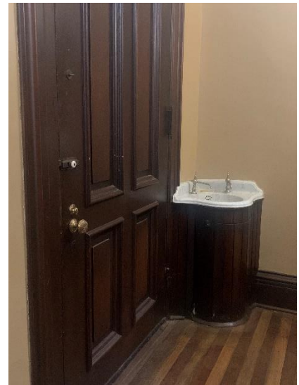
A view of the corner sink, showing its location, just inside an exterior door, and in close proximity to the kitchen.